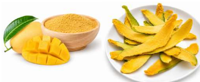
Figure 1: Mango Fruit, Its Peel, and Powder

then sieved to produce a final mass of particles with a diameter of 0.6 mm (Figure 1).