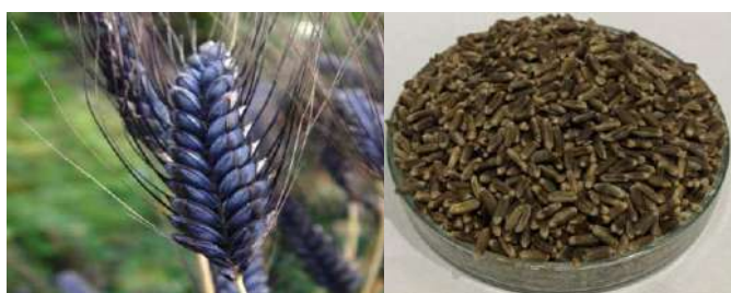
Figure 1: Black Wheat Plant and Seed

manufacture functional meals and colorants, with the main goal of creating items that are much better than conventional wheat [2]. Nevertheless, studies are being carried out using the given data to enhance its nutritional and functional properties, economic value, and outcomes to the fullest extent possible. Despite increasing interest in pigmented wheat varieties, the nutritional and therapeutic potential of black wheat remains underexplored compared to conventional white wheat. Limited comprehensive reviews exist that consolidate its bioactive compounds, antioxidant activity, and health benefits in a single study. Moreover, variations among different cultivars and the influence of environmental factors on its nutritional composition are not fully understood. Therefore, a systematic analysis is needed to provide an updated understanding of black wheat's functional properties (Figure 1).